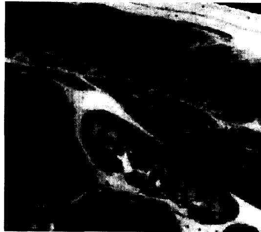
Figure 2: Optical image from the visible human project of a right kidney and a liver lobe.

which gives a realistic size for a full computer simulation of a clinical image. The optical image in Fig. 2 is used for scaling the standard deviation of the Gaussian random amplitudes of the scatterers. The relation between the gray level value in the image and the scatterer amplitude scaling is given by: